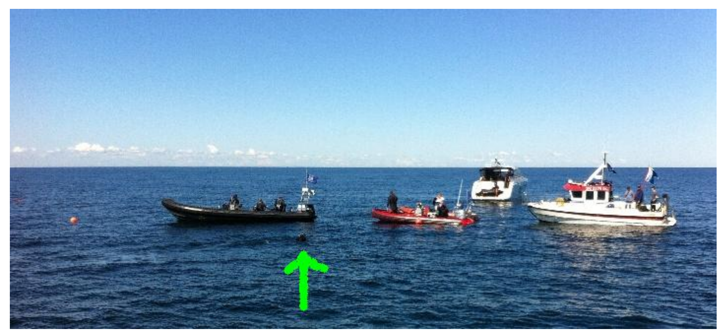
Our diving boats over the Halifax with red buoy (far left) marking the Halifax, and green arrow showing diver in the water

Soon we were on site and the exploration began with our 10 - 15 divers working in shifts, plotting out and finding, on and under the sandy bottom, all the parts of Halifax HR871. Remember, the Baltic Sea in this area of the Halifax location is almost fresh water because of the rivers and freshwater runoff in Sweden.