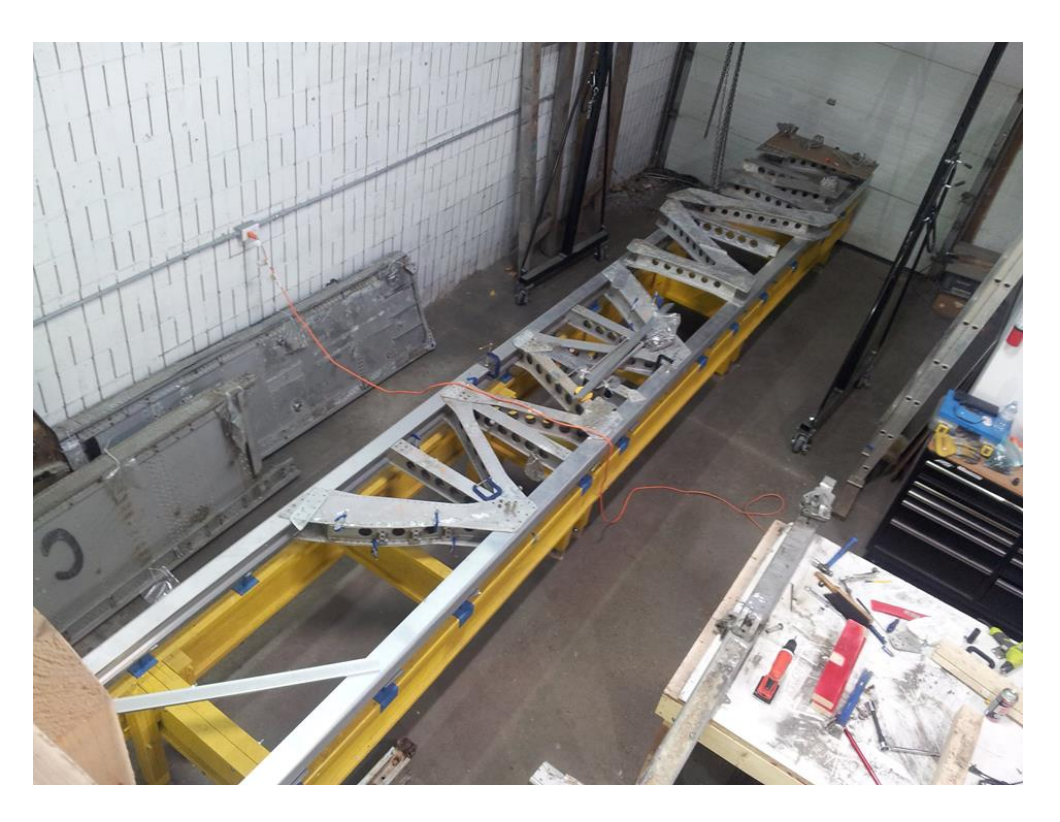
See above our Halifax main spar coming to life at Knox Tech in Ottawa

REMEMBER, we do not bring Halifaxes back to Canada because it is a cute looking bomber aircraft, we bring Halifaxes back to Canada because over 70% of the 10,659 Canadians killed-in-action in Bomber Command were flying the Halifax bomber when they sacrificed their lives for our Freedom.