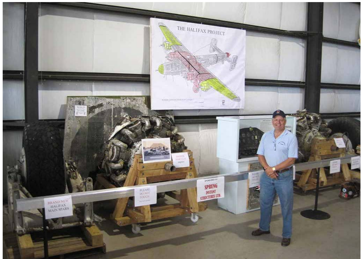
Halifax Project display

This display and new beginnings of a Halifax for the Bomber Command Museum were spotlighted by the museum for the media and public with a special ribbon-cutting ceremony for the Halifax Project being performed on August 19, the honoured guests of 408 Squadron - Commanding Officer and crews attending, as we opened up the Halifax exhibit and start of our Halifax Project. See the photo of our new Halifax Project exhibit below.