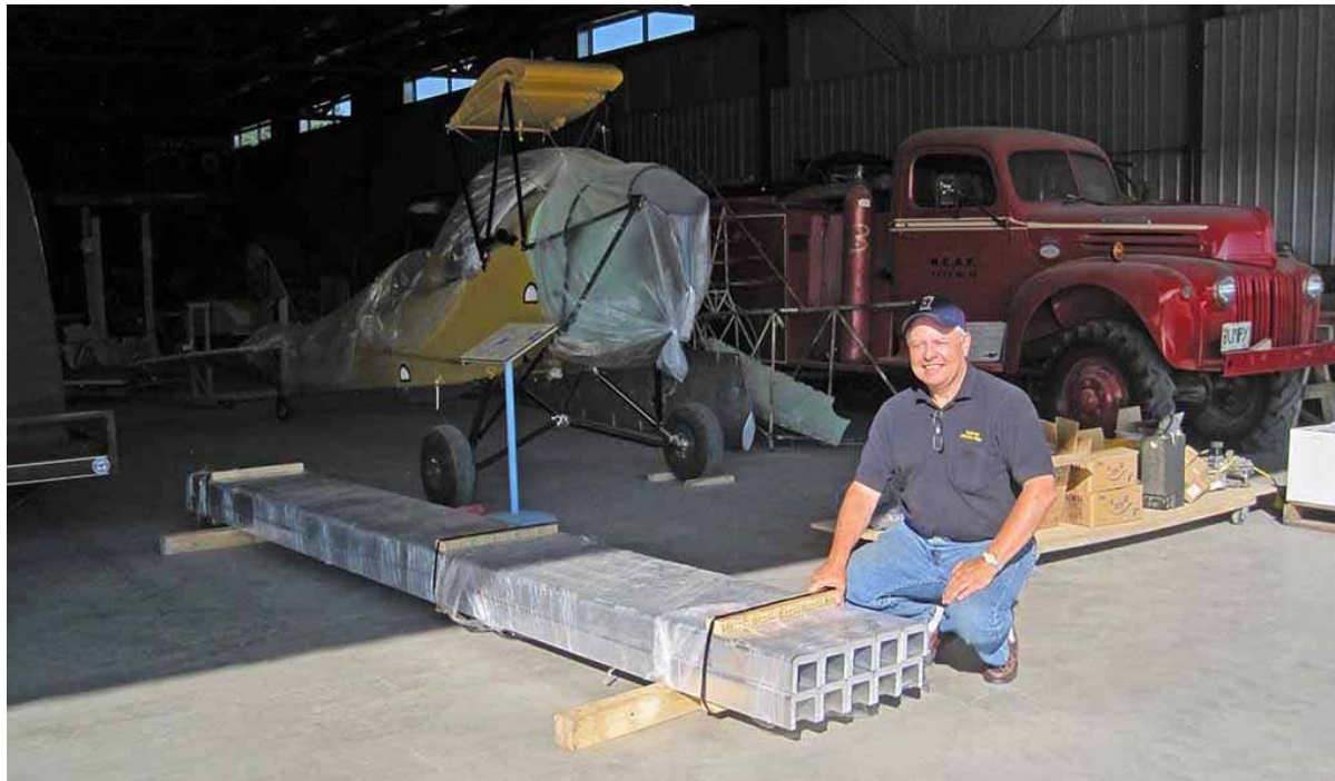
main spars and friend

Thanks to the vision and patriotism of the staff of Sprung Instant Structures Ltd., the world leaders in building structures with aluminum beams, our NEW Halifax main-spar beams were made by Sprung and delivered to us at the Bomber Command Museum of Canada on August 16, 2011. This manufacture of NEW main-spars for a British heavy bomber is unprecedented in historic aircraft rebuilds and the warbird world!! See a smiling yours truly below with our 2 full sets of new Halifax main-spars just after delivery in August.