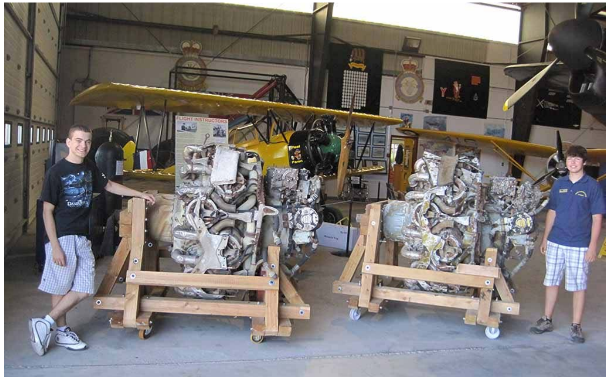
2 Hercules engines