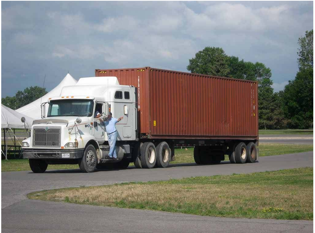
Container arrives from Malta

To all our Members and Supporters I would like to point out the significance of the photo above. The semi-rotund fellow in blue is yours truly, and although it looks like I am pointing out a location for the truck driver to position his rig in late July 2011, at the home of our friends of the Halifax Project - the Canada Aviation and Space Museum in Ottawa, I am actually pointing the way to some very important times and discoveries in the future of Halifax 57 Rescue (Canada)! I will explain at the end of this report after I have given you all the exciting updates.