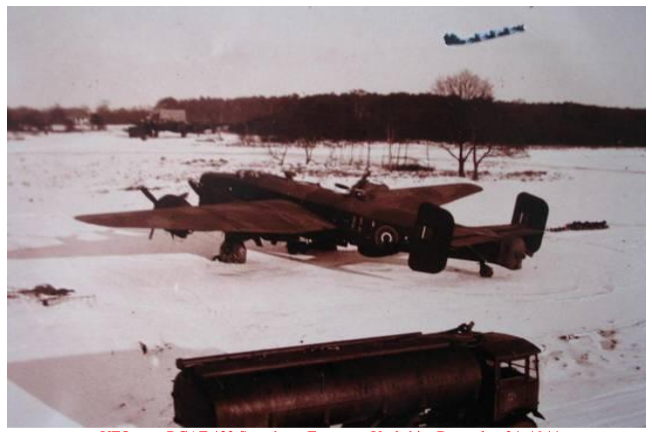
UFO over RCAF 432 Squadron- Eastmoor, Yorkshire December 24, 1944